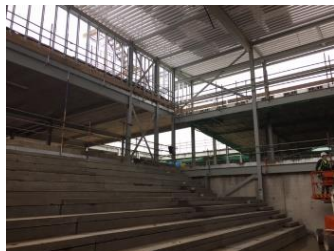
Springwell Leeds South, Middleton