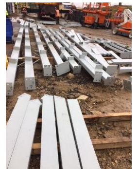
Springwell Leeds North, Tinshill