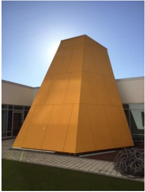
Springwell Leeds East, Seacroft