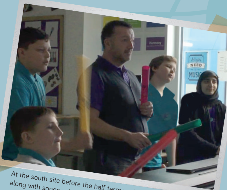
At the south site before the half term we had a fab time playing along with songs using boomwhackers. All the students enjoyed the experience and it was a great exercise in teamwork, listening skills and cooperation. And a right laugh too!!!