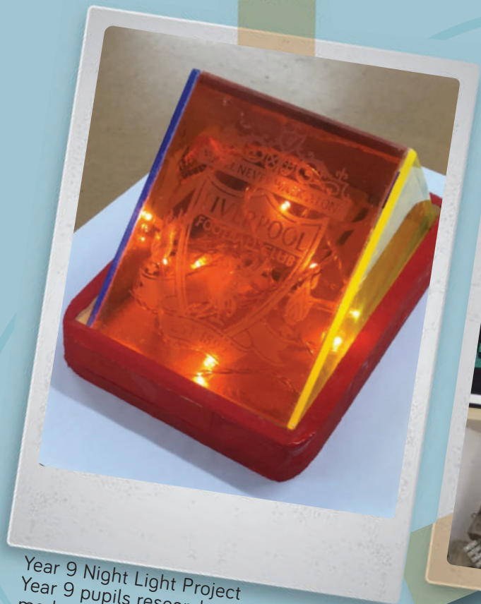
Year 9 Night Light Project Year 9 pupils researched, designed and made a night light. The Laser cutter was used to imprint their idea onto acrylic.