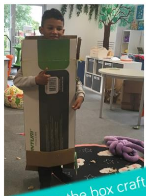
Enjoying the box craft session

Each week Leeds United coaching staff have been delivering sessions to Primary pupils. Engagement has been fantastic and staff have also been involved in the weekly fun sessions. The sessions have