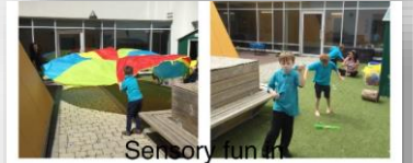
Sensory fun in Willow class.