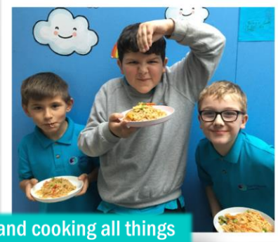
Learning and cooking all things healthy!