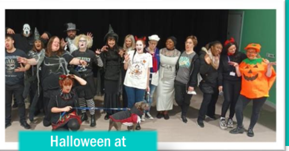
Halloween at Spookwell Academy